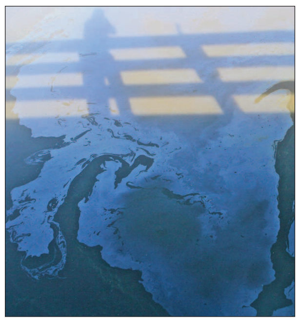
Oil slick is clearly visible Tuesday in river channel.