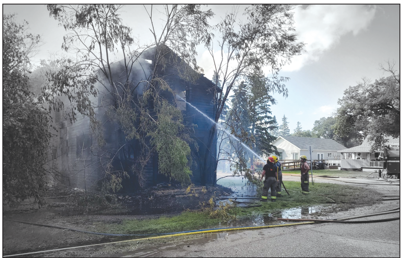
Rivers/Daly Fire Department was dispatched to a report of a structure fire in the 600 block of 4th St. in Rivers the fire was under control and the scene cleared.