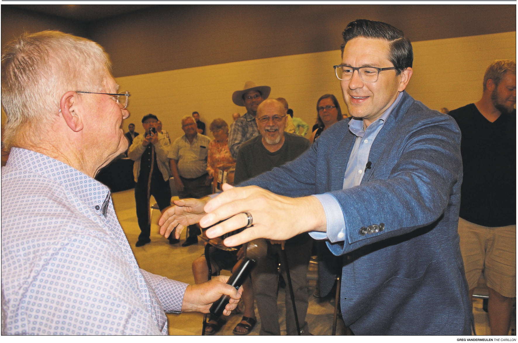
Conservative leadership candidate Pierre Poilievre comes in for a hug from Senator Don Plett as he prepares to speak at a Morris campaign rally on Friday.

IN STEINBACH Poilievre brings message to Morris