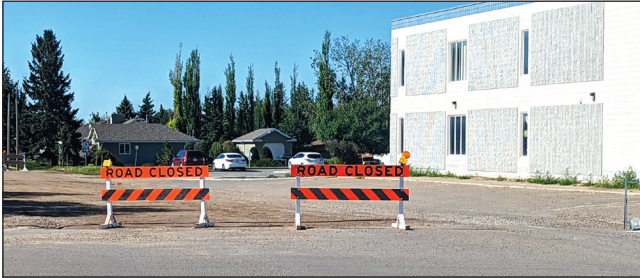
ROAD CLOSURE: Work on the 4th St. sanitary main upgrade was expected to begin on Monday, July 25.

The Town put out an updated communications bulletin following the meeting to assure residents, that "construction was to commence July 25, and provided updated maps to direct local traffic to surrounding amenities during the upgrades. "At this time 4th Street from Highway 25 to 5th Street South will be closed to vehicular and pedestrian traffic."