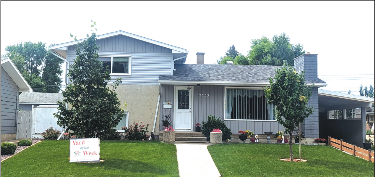
YARD OF THE WEEK: Pictured at 2235, 23 Avenue. Communities in Bloom will be holding their 20th Anniversary Coaldale Garden Tour on July 30, 2-4 p.m.