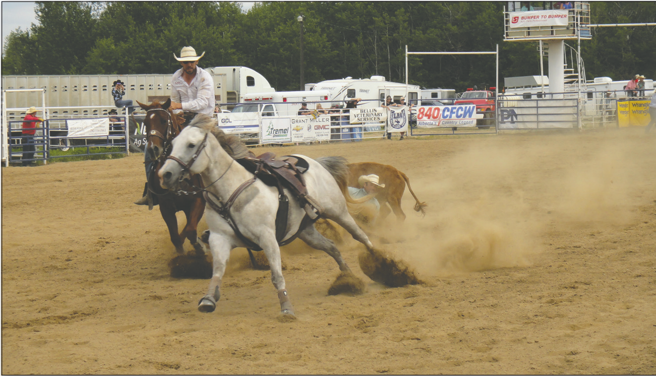
It takes guts and training to slide off your horse onto a steer at full speed.