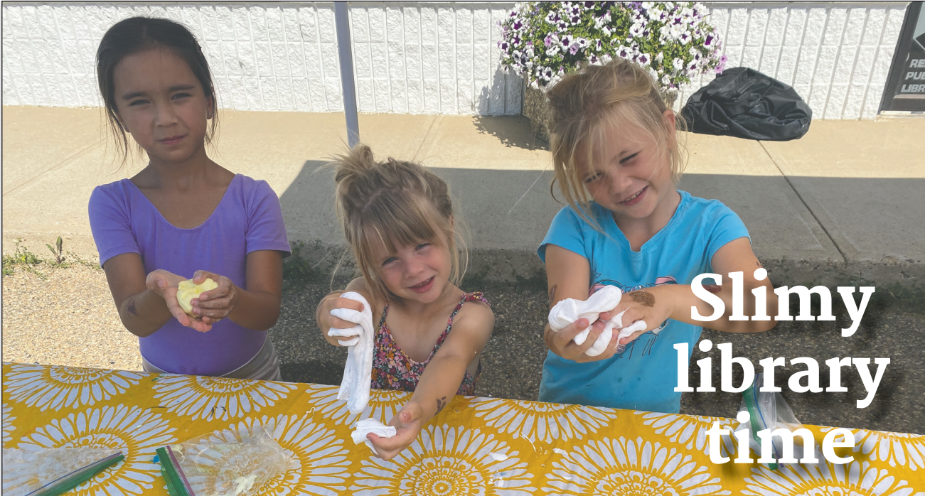
Last week, kids enjoyed slime with friends at the Redwater Library